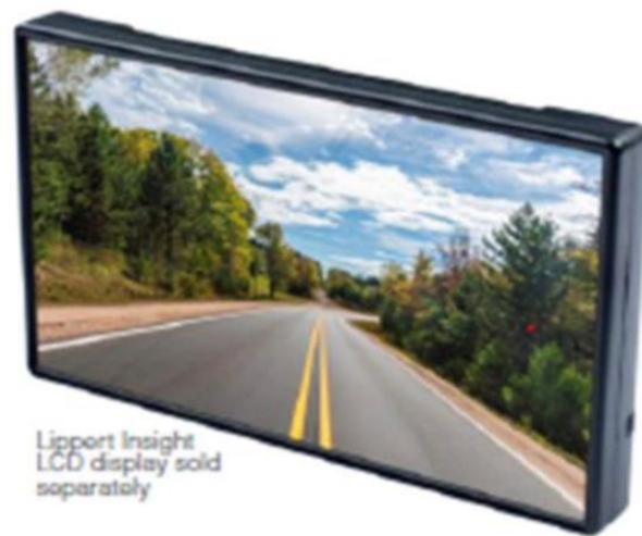
Lippert Insight LCD display sold separately